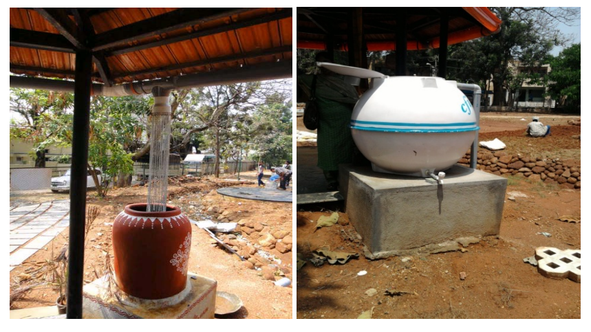
Plate 1: Rooftop RWH, Theme Park, Photo: Manasi. S

To avoid contamination, precaution should be taken to protect stored water by covering it properly so that either sunlight or dust does not enter the sump/tank. It is also important to manually maintain the storage system by cleaning of filters, removing of leaves and twigs and other wastes from the mesh etc, for obtaining good results.