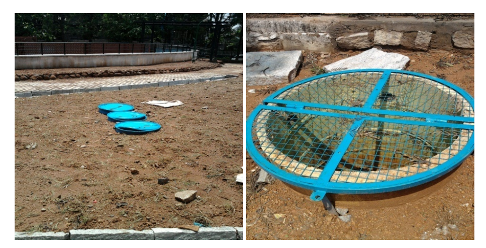
Plate 4: Ground water recharge pit, Theme Park